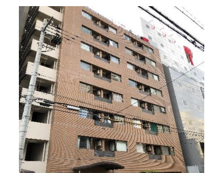
Depends on the condition of the property

Monthly Costs ¥43,000 -1R(20 m²) Size ¥ 0-Deposit ¥0-Key money Floor 2 ¥3000-Management fee Train line Metro Sakaisuji Year Built 1982 More detail please ask us